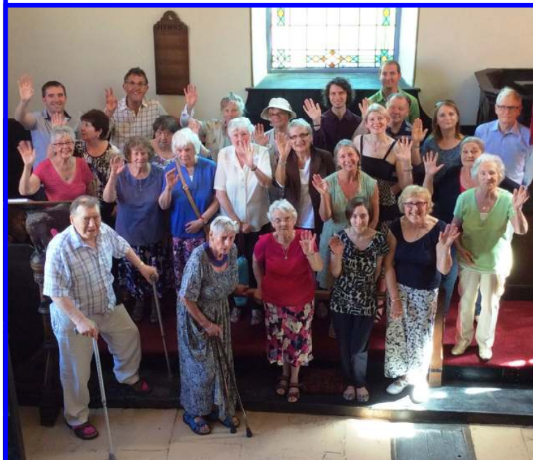
Northern Unitarian Association visit to Whitby on June 18th