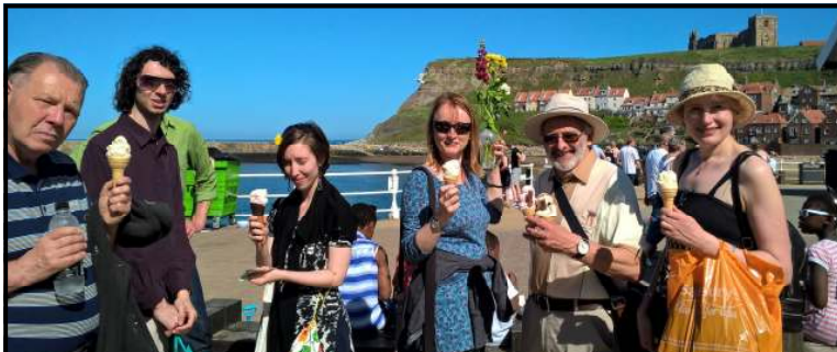
Ice creams By the harbour after the service!

After the service we flocked to the beach, licked ice cream on the golden shore, stood in the shadow of the harbour lighthouse, banked at the promenade's furthest reach. The sea was just incredible and the sand seemed to stretch to the ends of the earth. Even though it was months ago now, it clearly was a day to remember."